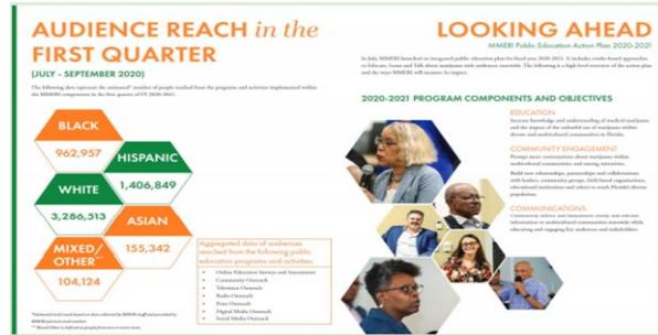
Figure 1. MMERI's Reach of Florida's Diverse Populations: July – Sept 2020 Quarter