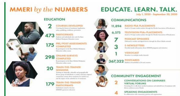
Figure 2. MMERI's Educational Outreach Campaign: July – Sept 2020 Quarter